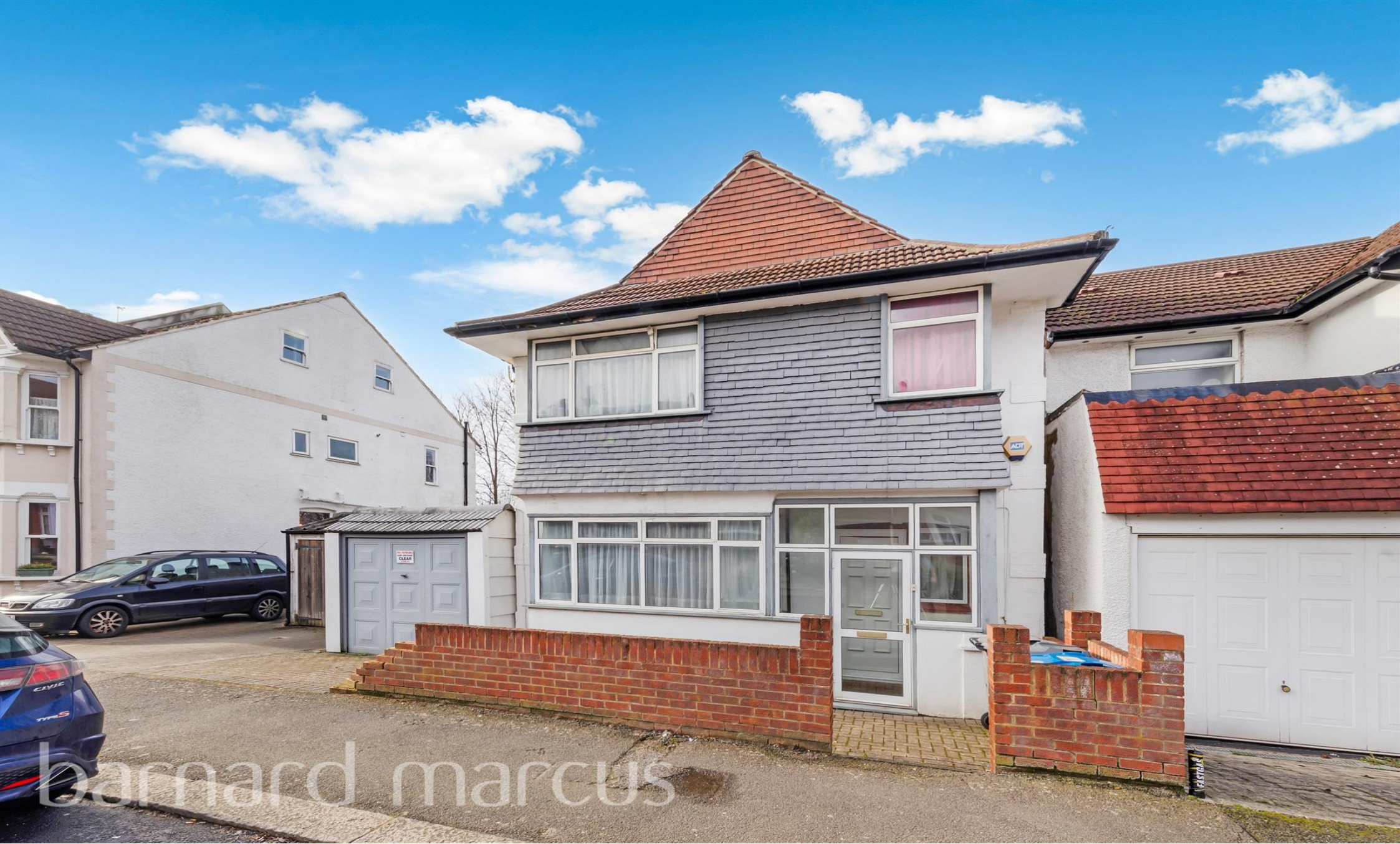
Florence Road, South Croydon CR2 0PP