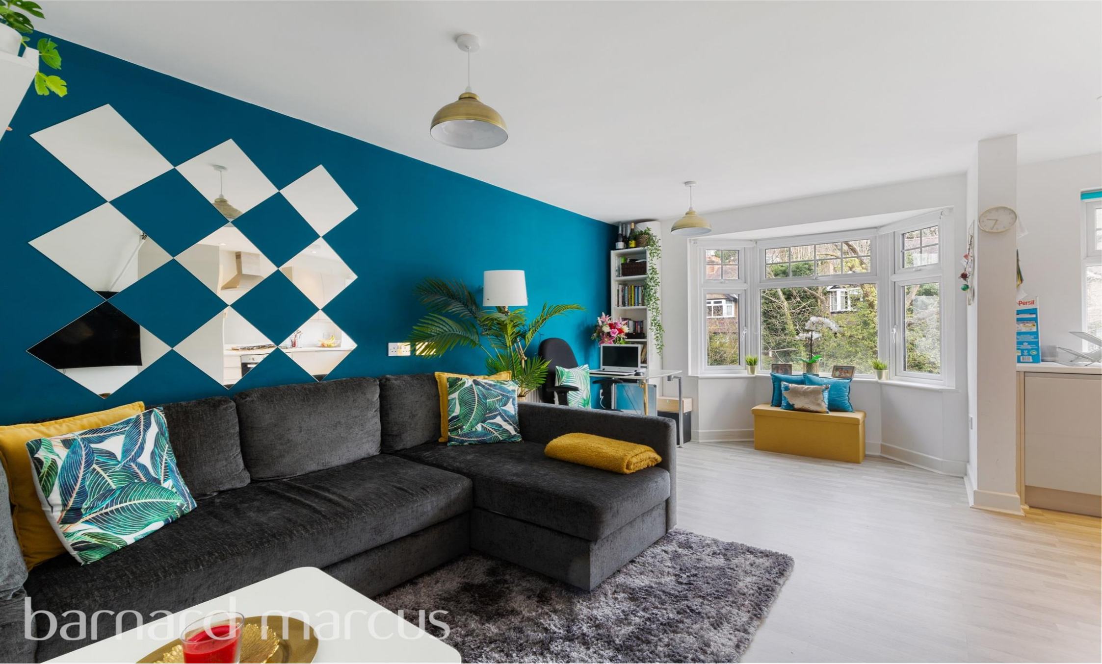
Platinum Apartments Lower Road, Kenley CR8 5FF