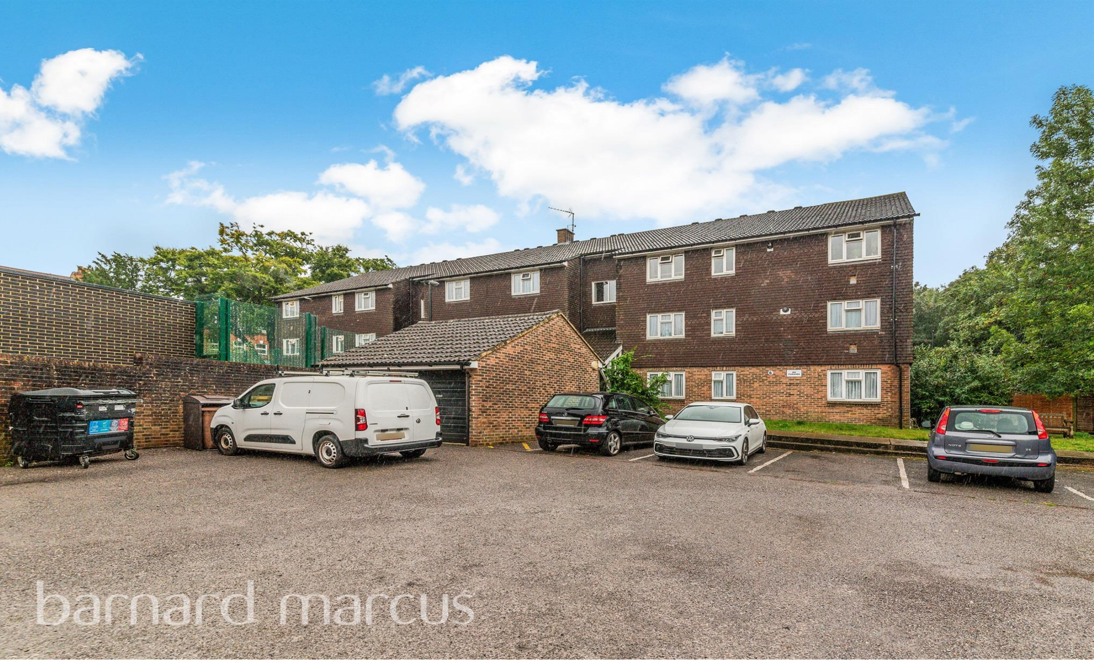
Oaklea Court Kendall Avenue, South Croydon CR2 0NH