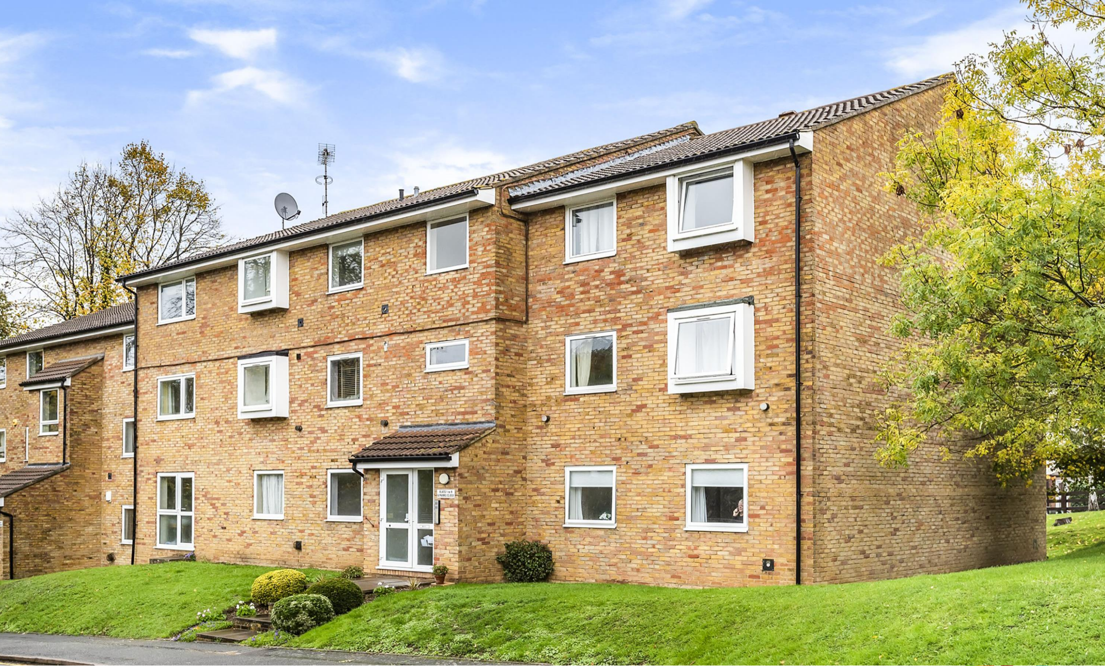
Parrs Close, South Croydon CR2 0QX