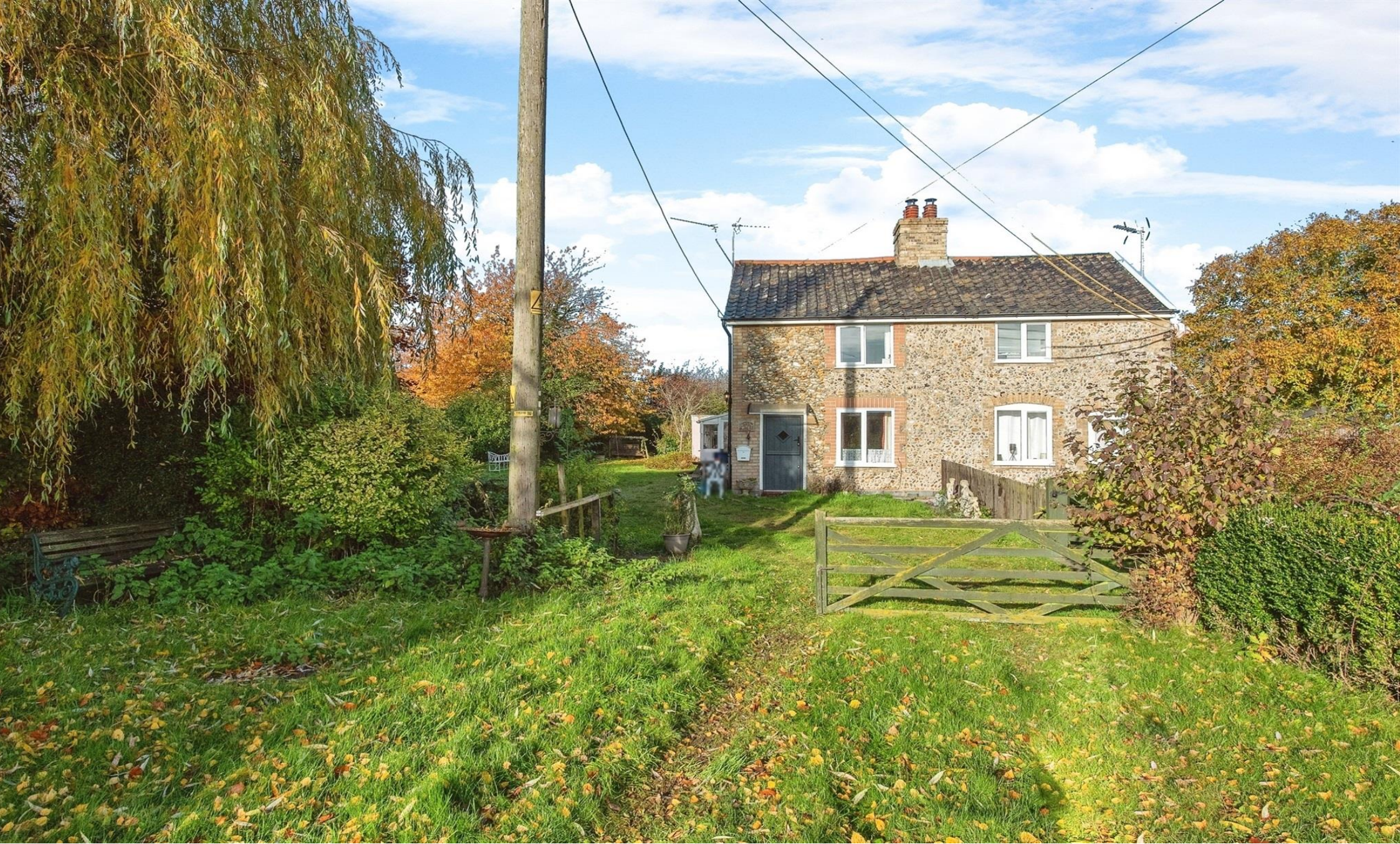
Copper Rose Cottage Warren Lane, Woolpit Bury St. Edmunds IP30 9RT