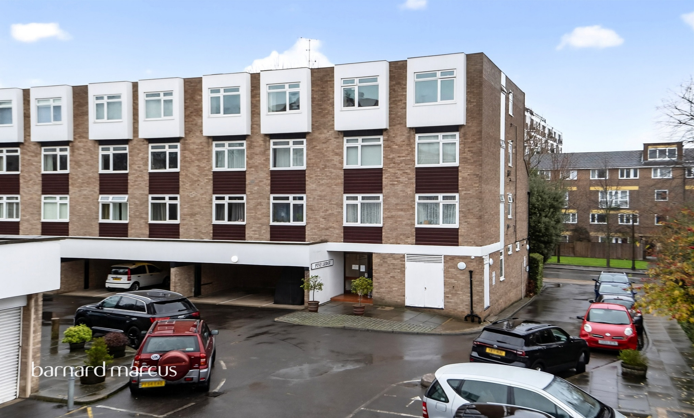
Pine Lodge, Whitefield Close, Putney, London, SW15 3SS