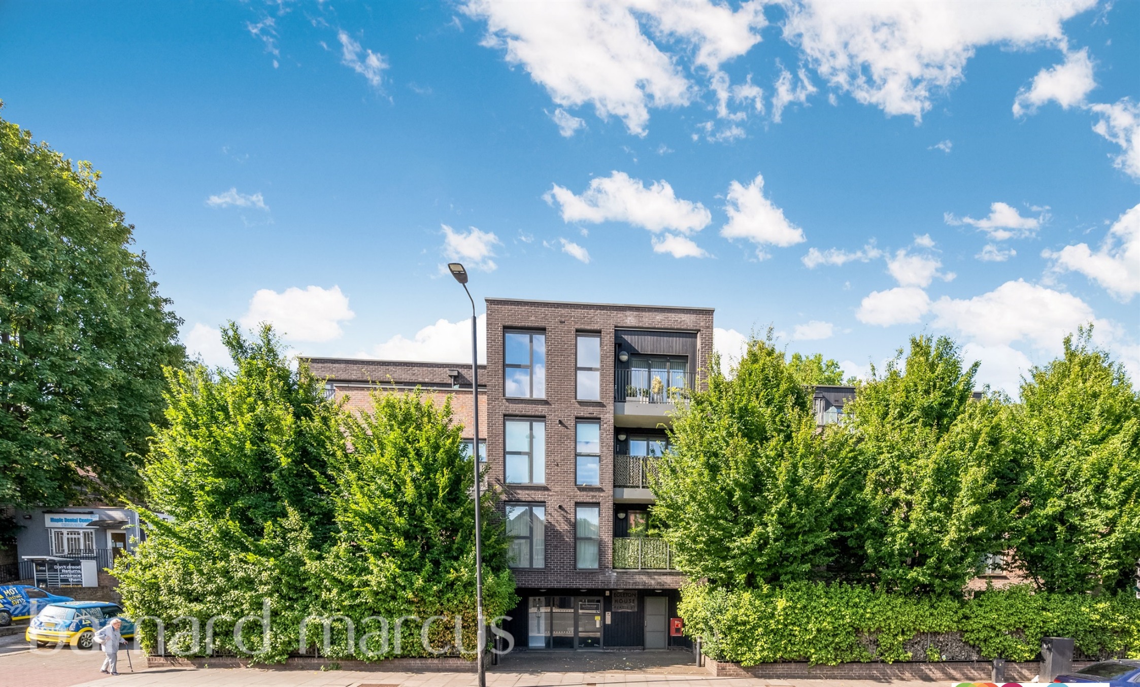
Egleton House, Roehampton Lane, Putney SW15 4LE