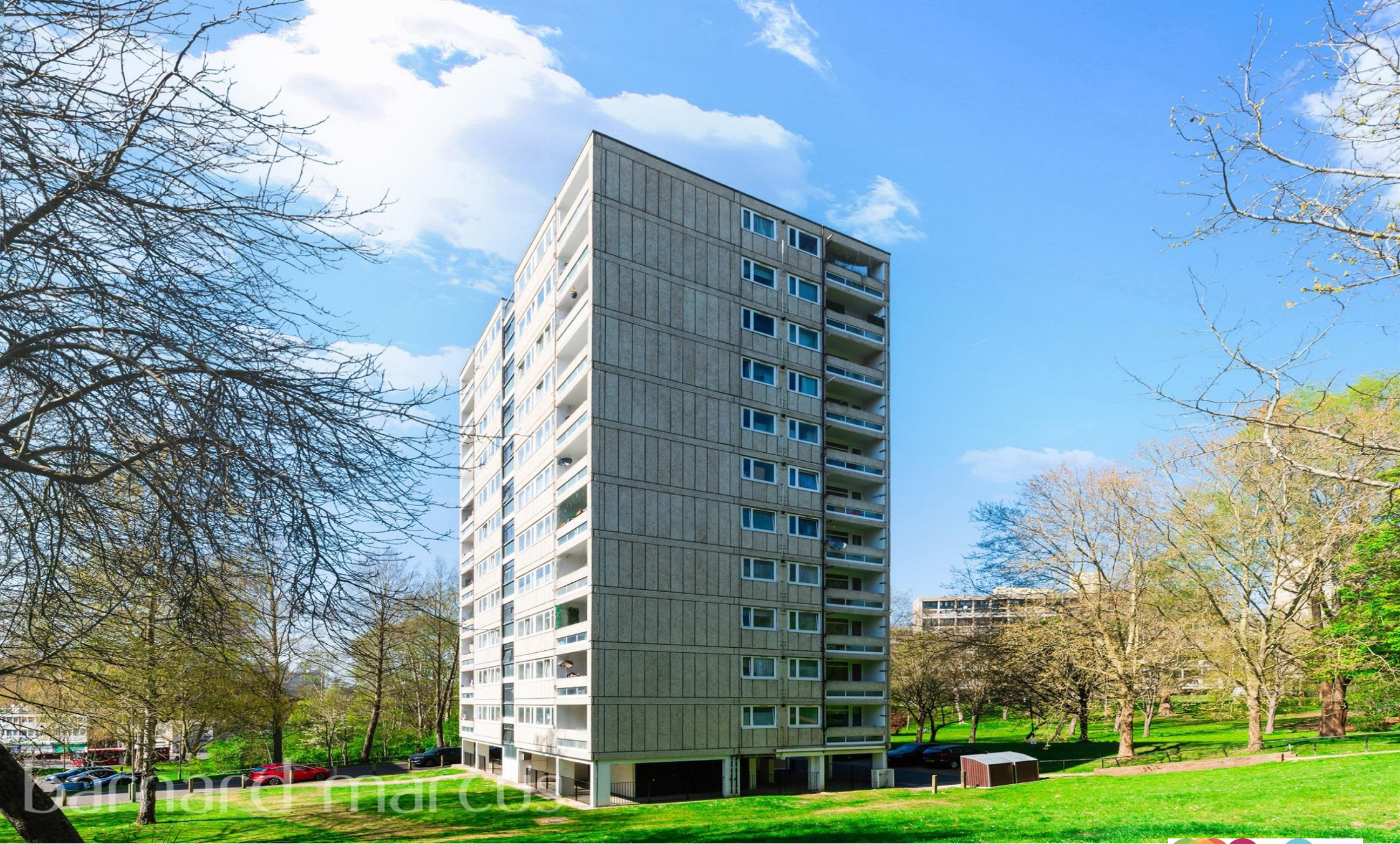
Egbury House, Tangley Grove, London SW15 4EL