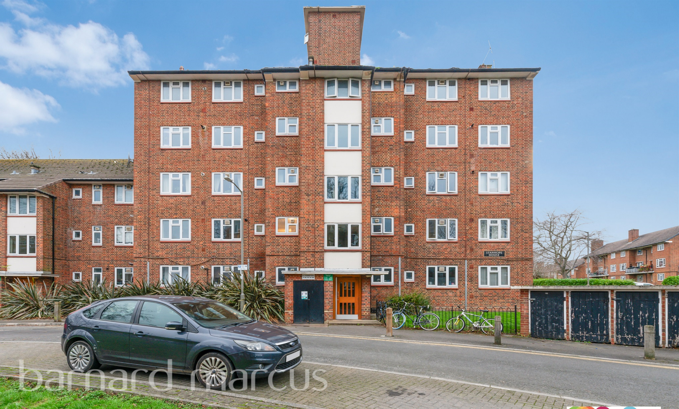
Stanhope House Whitnell Way, London SW15 6BY