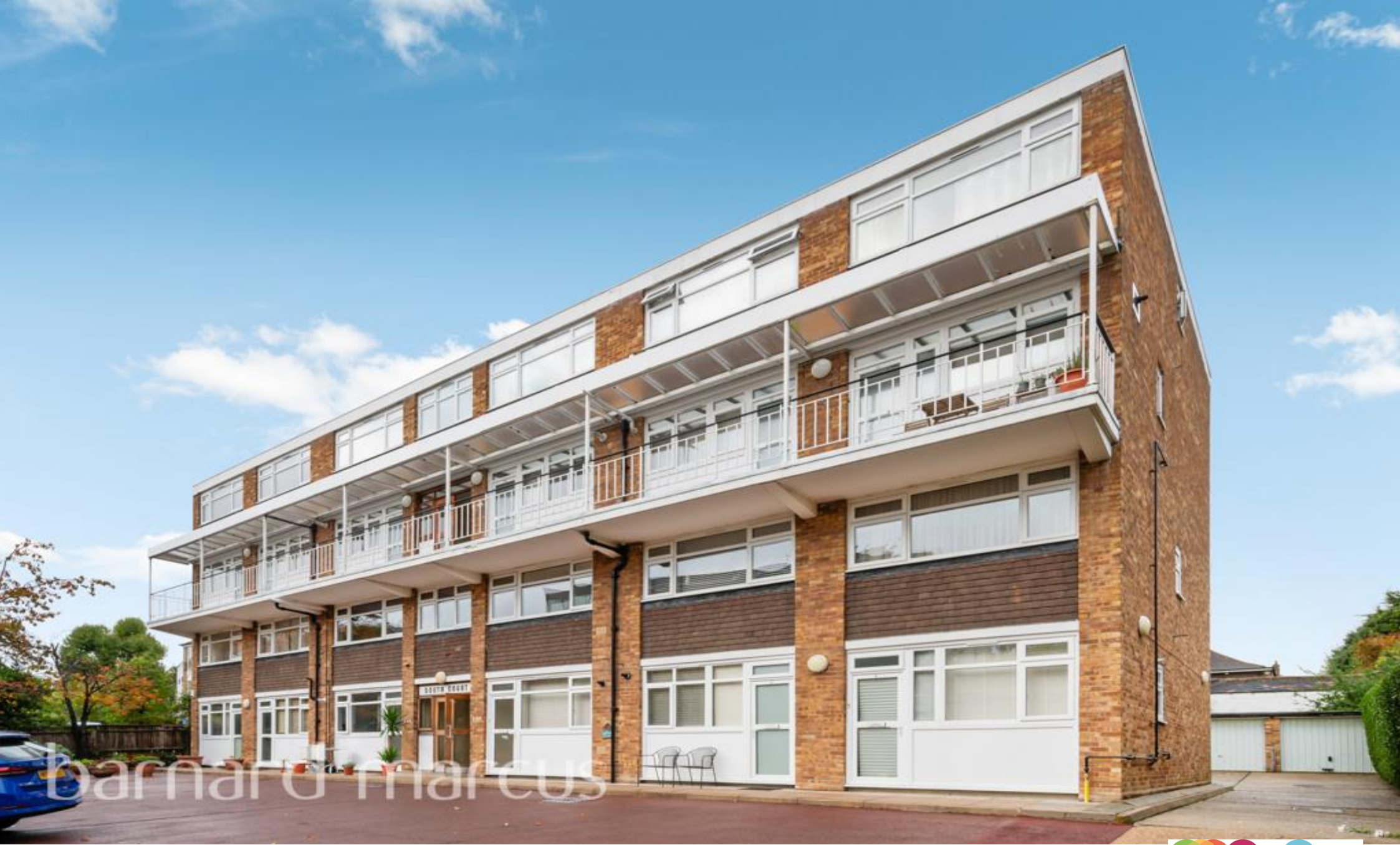
South Court, Kersfield Road, London SW15 3HQ