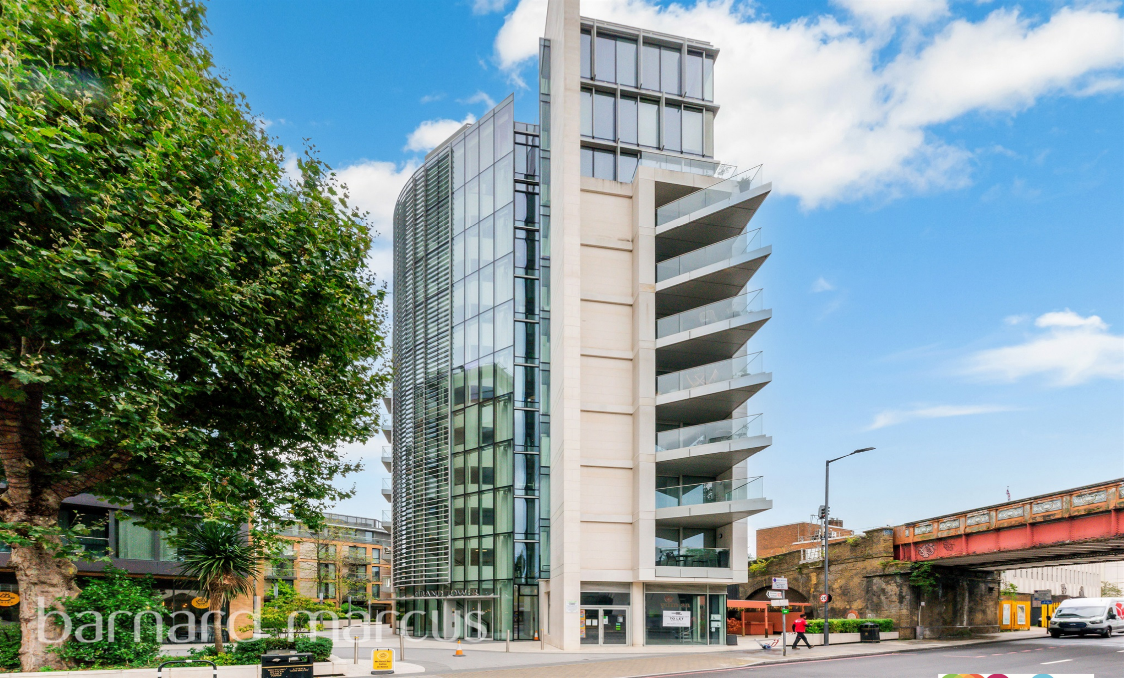
Grand Tower, Plaza Gardens, London SW15 2DF