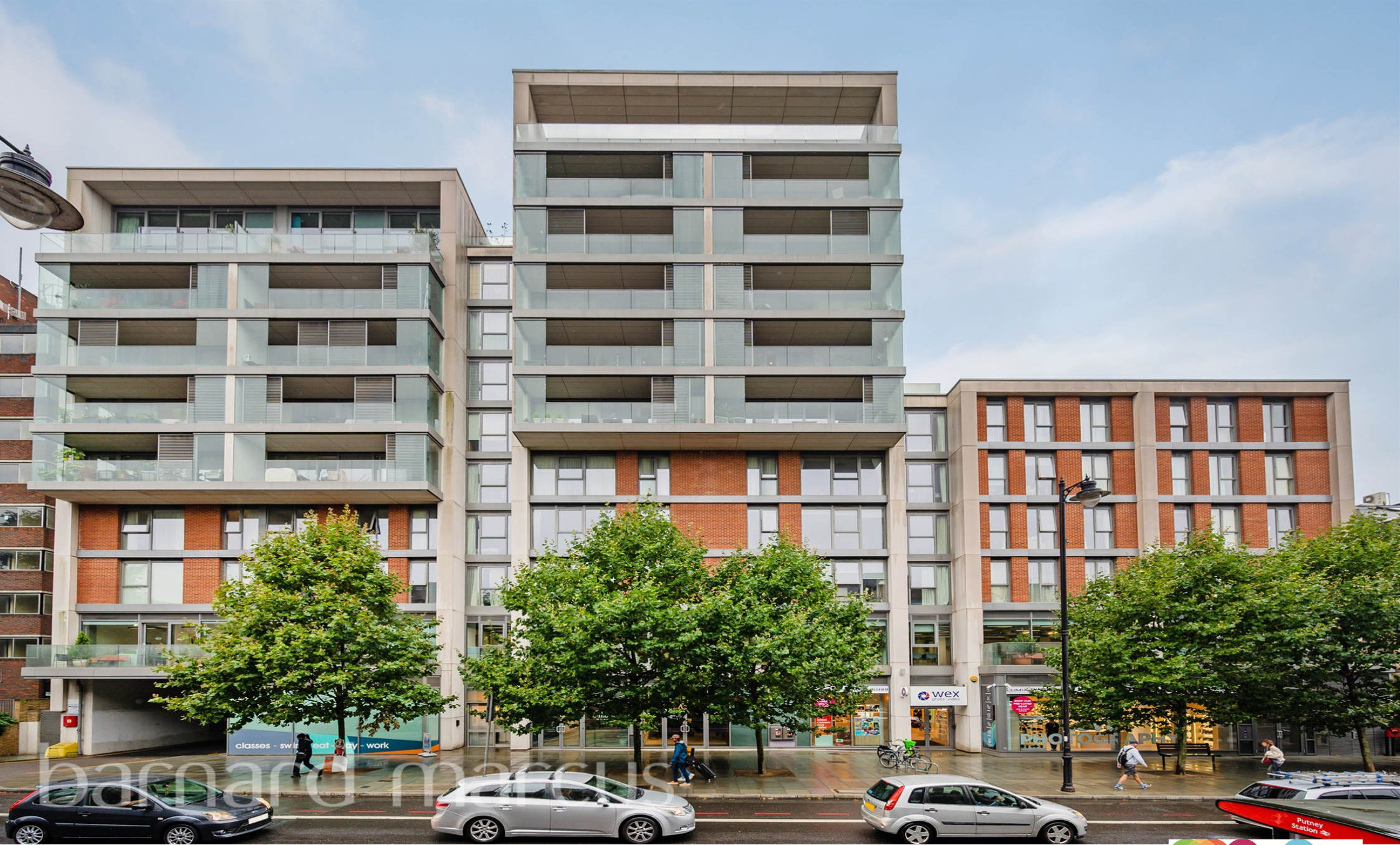
Tileman House, Upper Richmond Road, London SW15 2DD