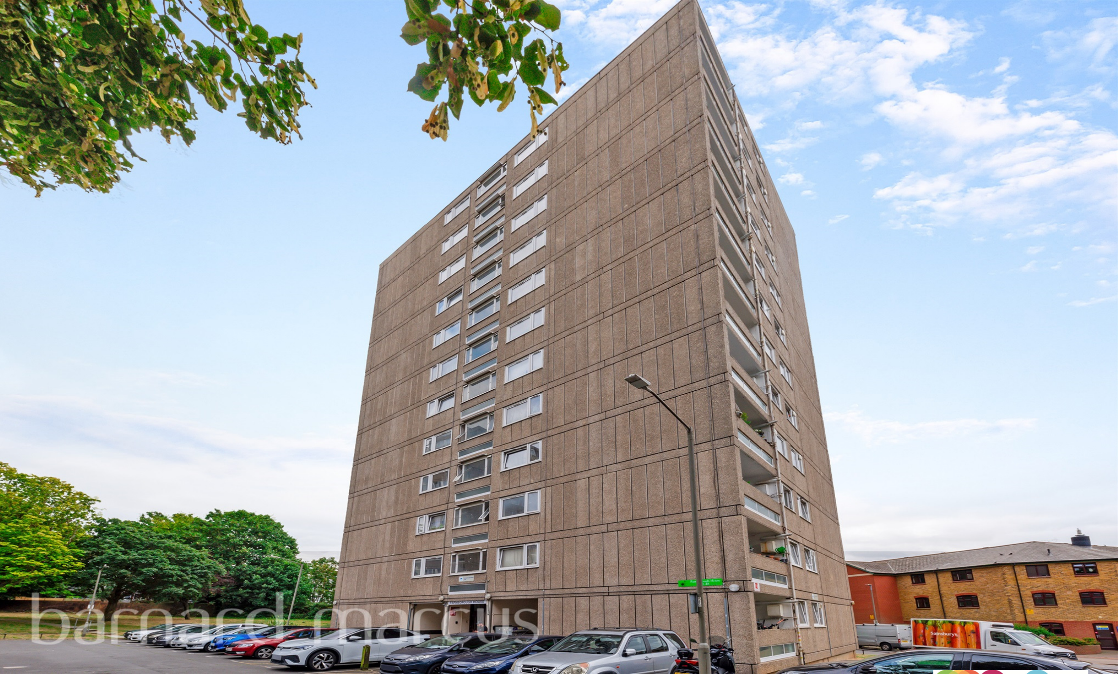
Farnborough House, Fontley Way, London SW15 4NF