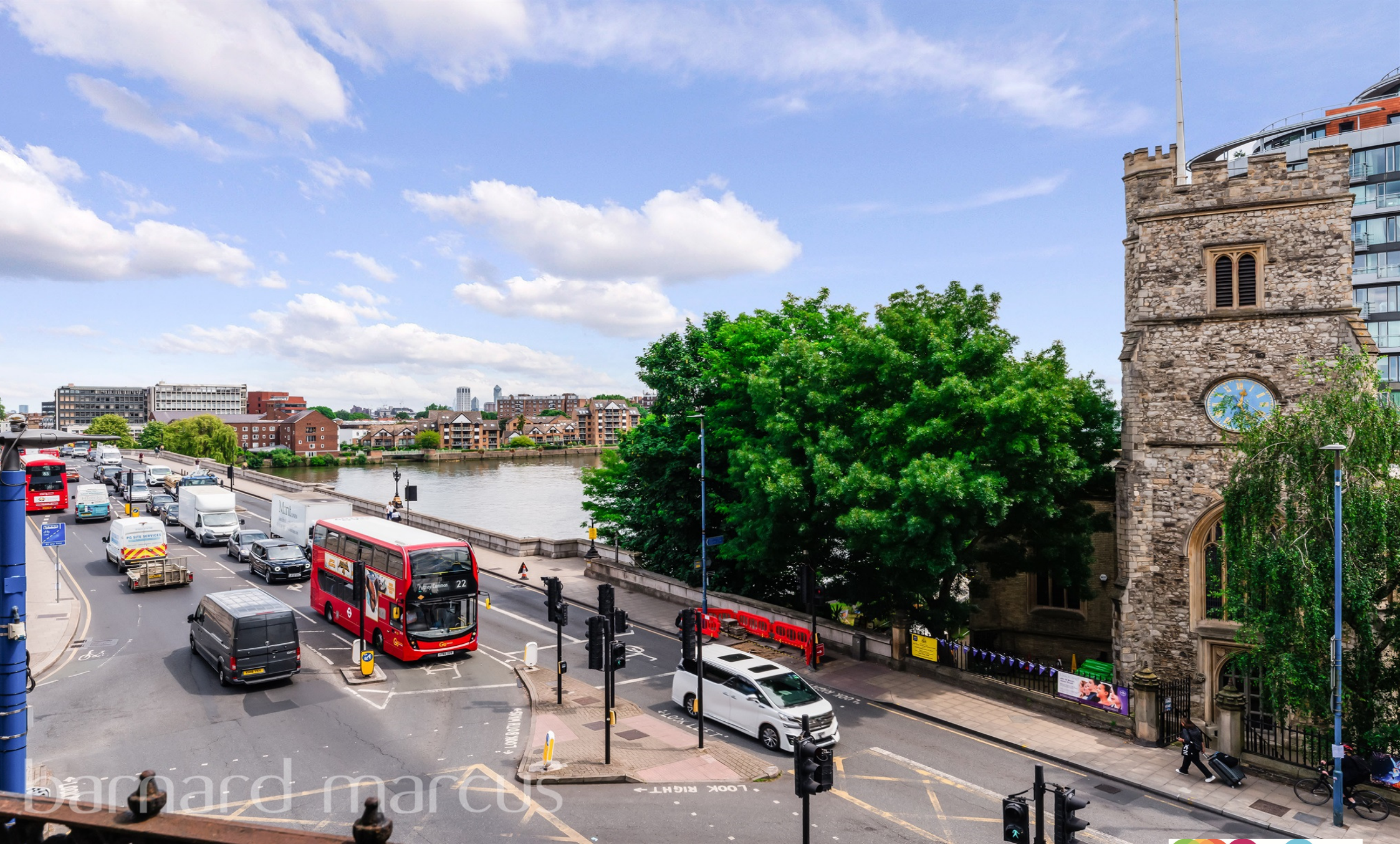
Putney High Street, London, SW15 1SL