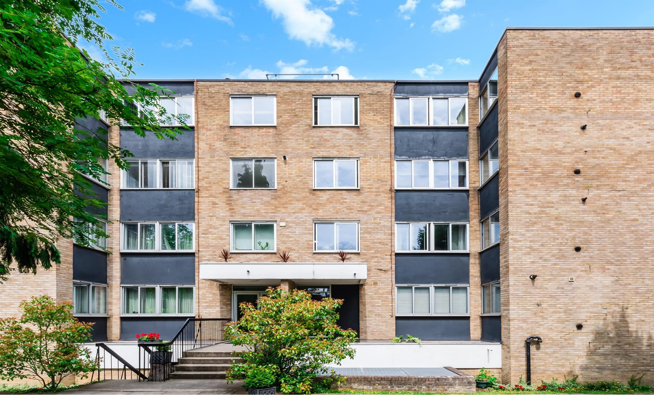
Lane End, West Hill, London, SW15 3SH