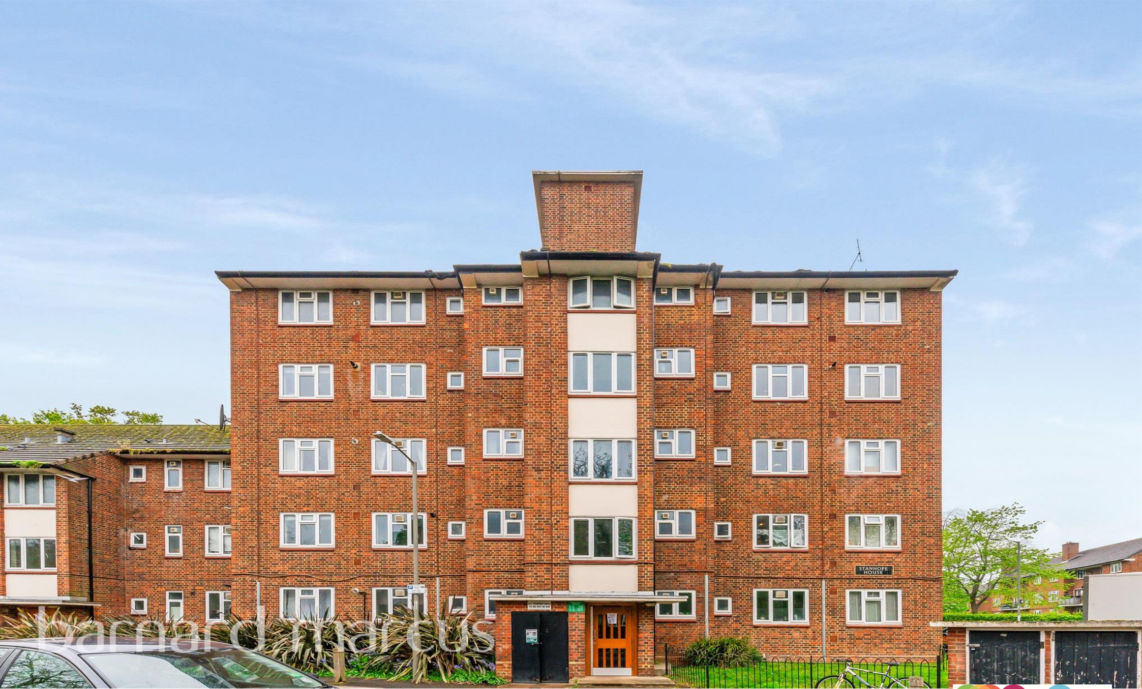
Stanhope House, Whitnell Way, London SW15 6BY