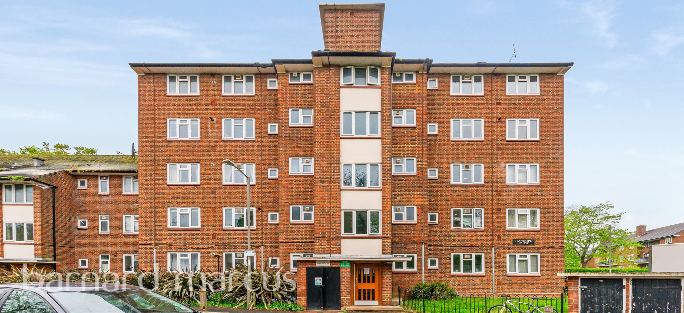
Stanhope House, Whitnell Way, London, SW15 6BY