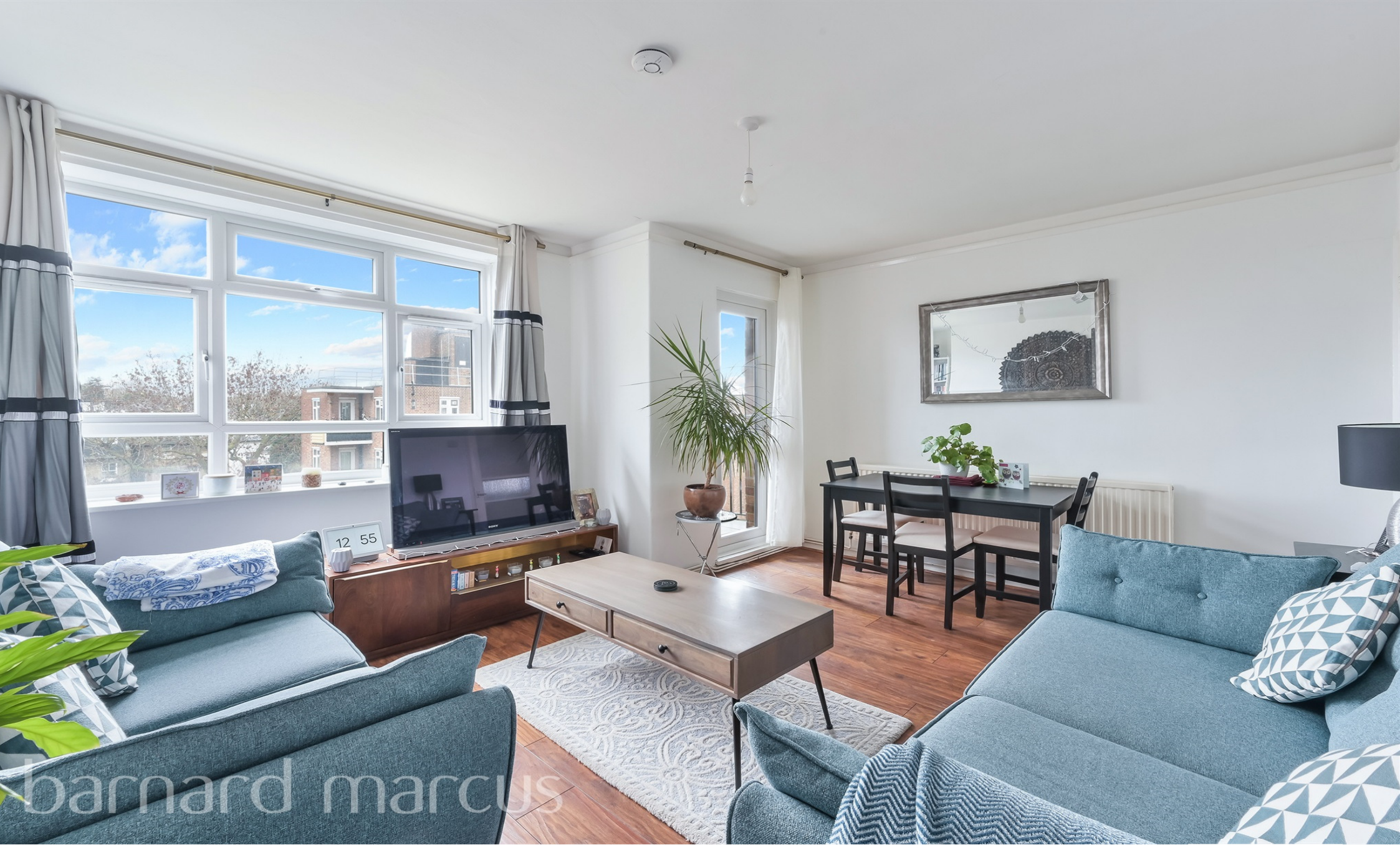
Woodhams House, West Hill, London, SW18 1RJ