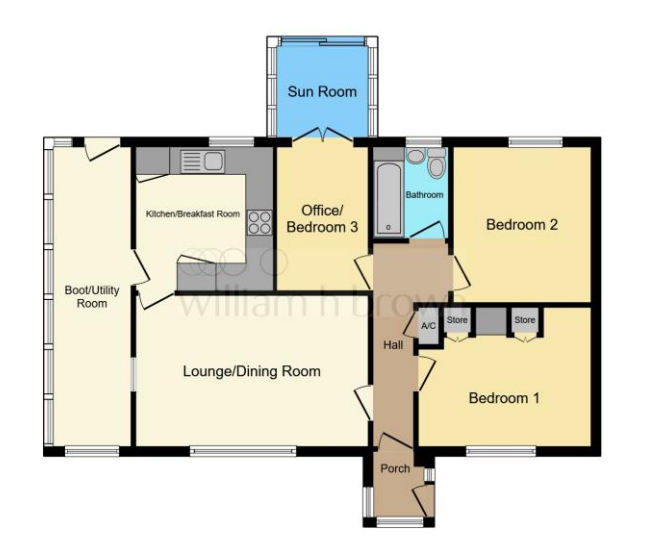
This floorplan is for illustrative purposes only and is not drawn to scale. Measurements, floor-areas, openings and orientations are approximate. They should not be relied upon for an purpose and do not form any part of an agreement. No liability is taken for any error or mis-statement. All parties must rely on their own inspections.