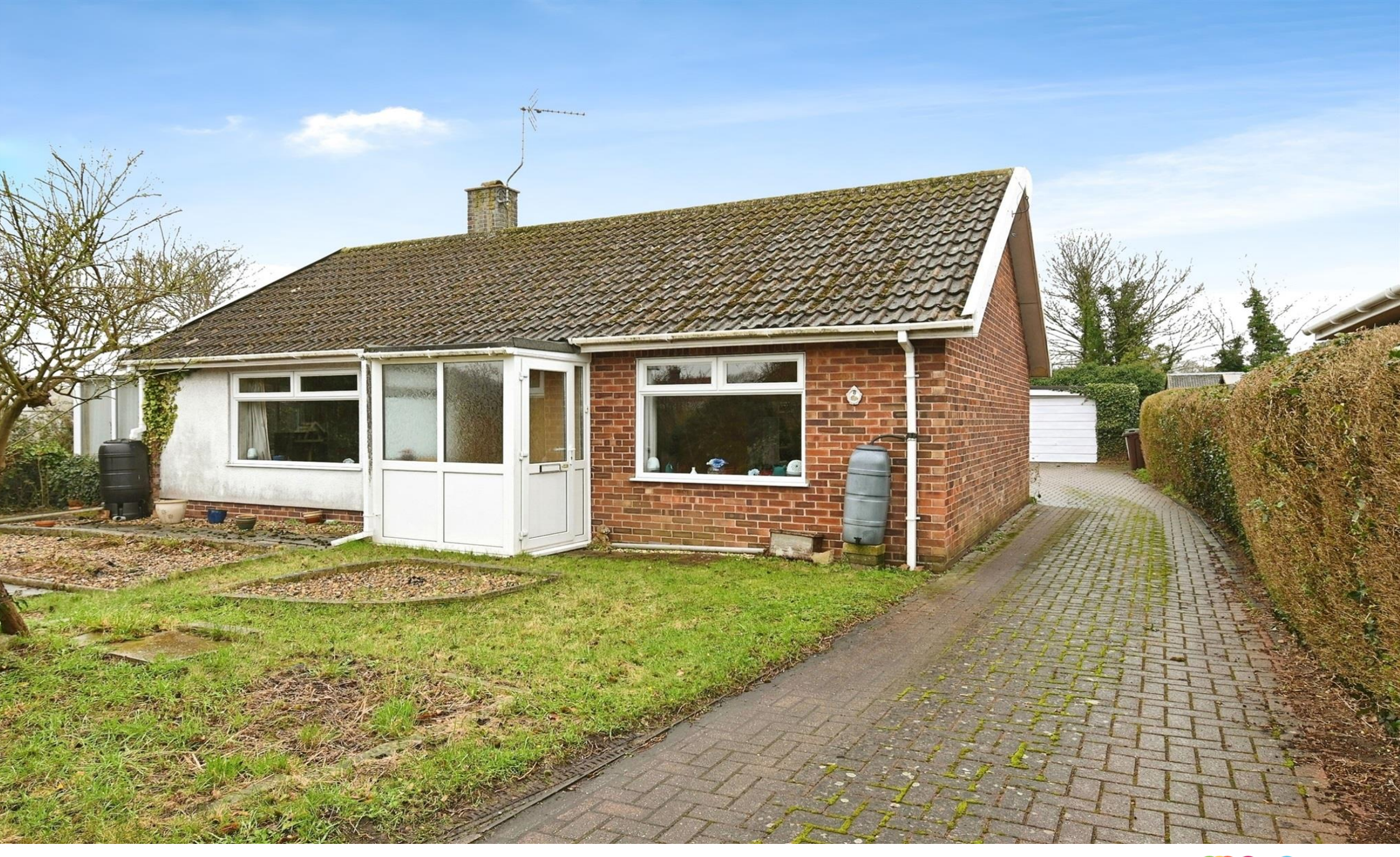
Black Horse Lane, Ditchingham BUNGAY NR35 2RB