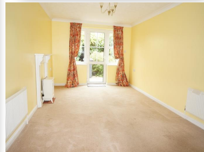
Meadow View, Bungay NR35 1HP