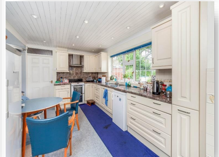
Newgate, Kirby Cane NR35 2PP