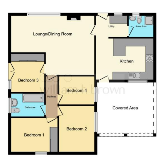
This floor plan is for illustrative purposes only. It is not drawn to scale. Any measurements, floor areas (including any total floor area), openings and orientation are approximate. No details are guaranteed, they cannot be relied upon for any purpose and they do not form part of any agreement. No lability is taken for any error, omission or misstatement. A party must rely upon its own inspection(s). Powered by www.focatagent.com