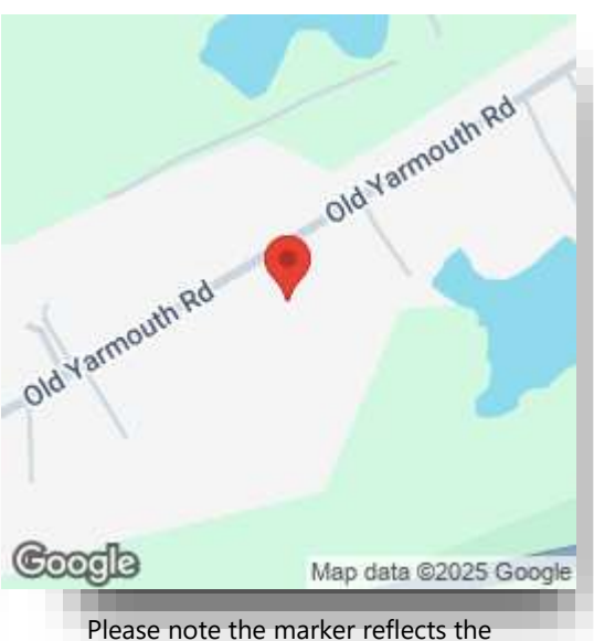
postcode not the actual property