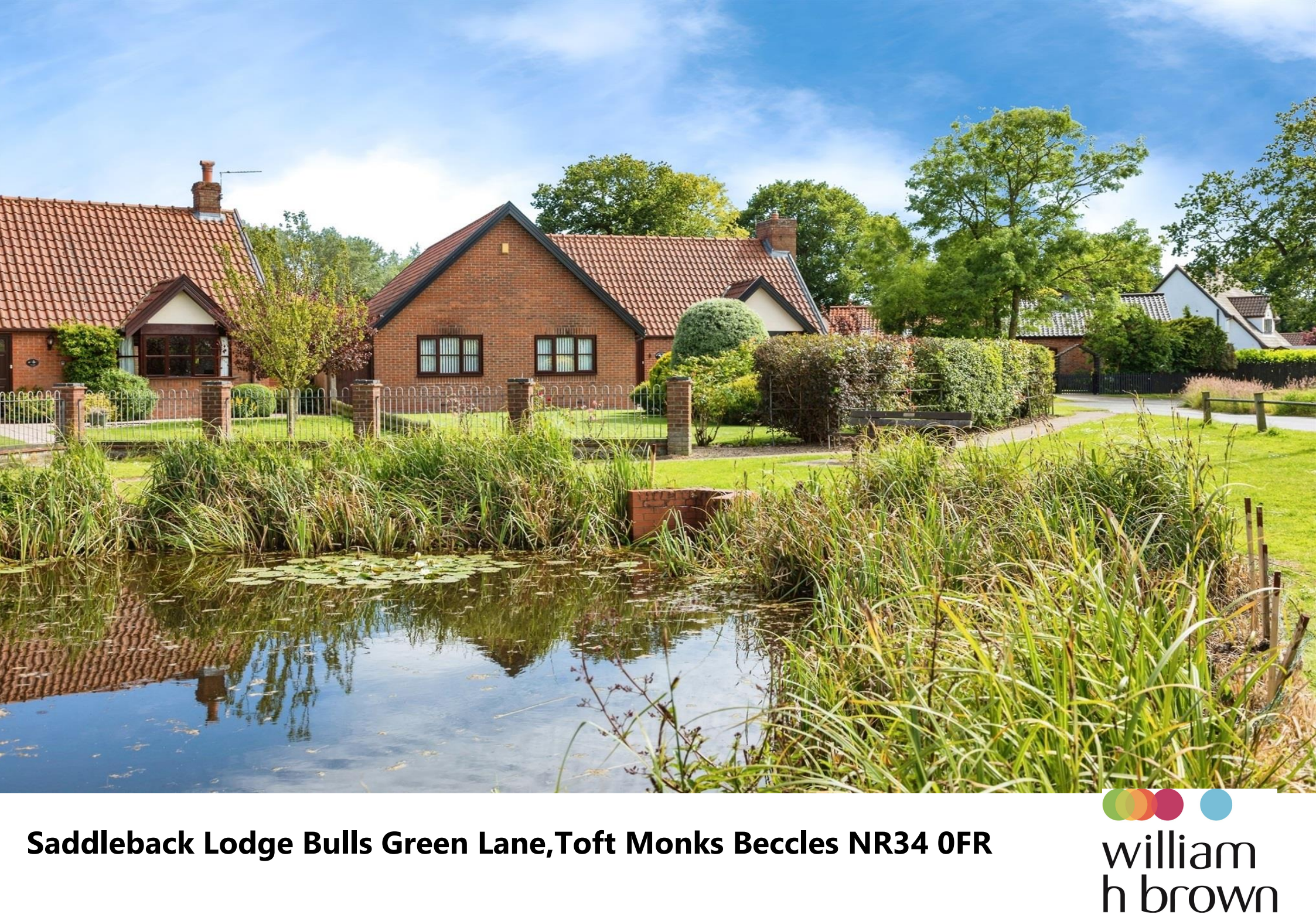
Saddleback Lodge Bulls Green Lane, Toft Monks Beccles NR34 0FR