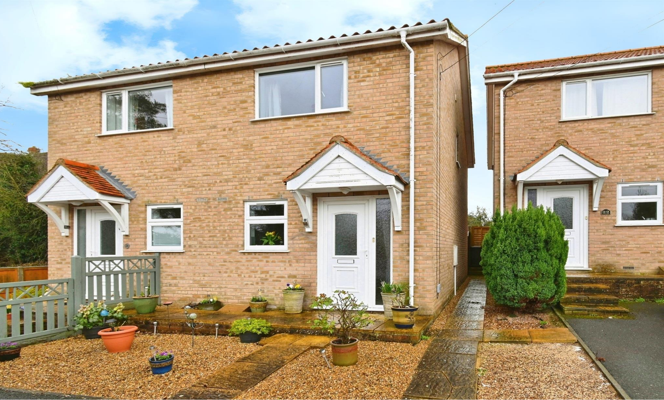
Dukes Road, Bungay NR35 1RP