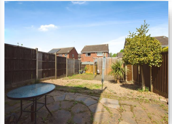
Wood Link, NOTTINGHAM NG6 7FW