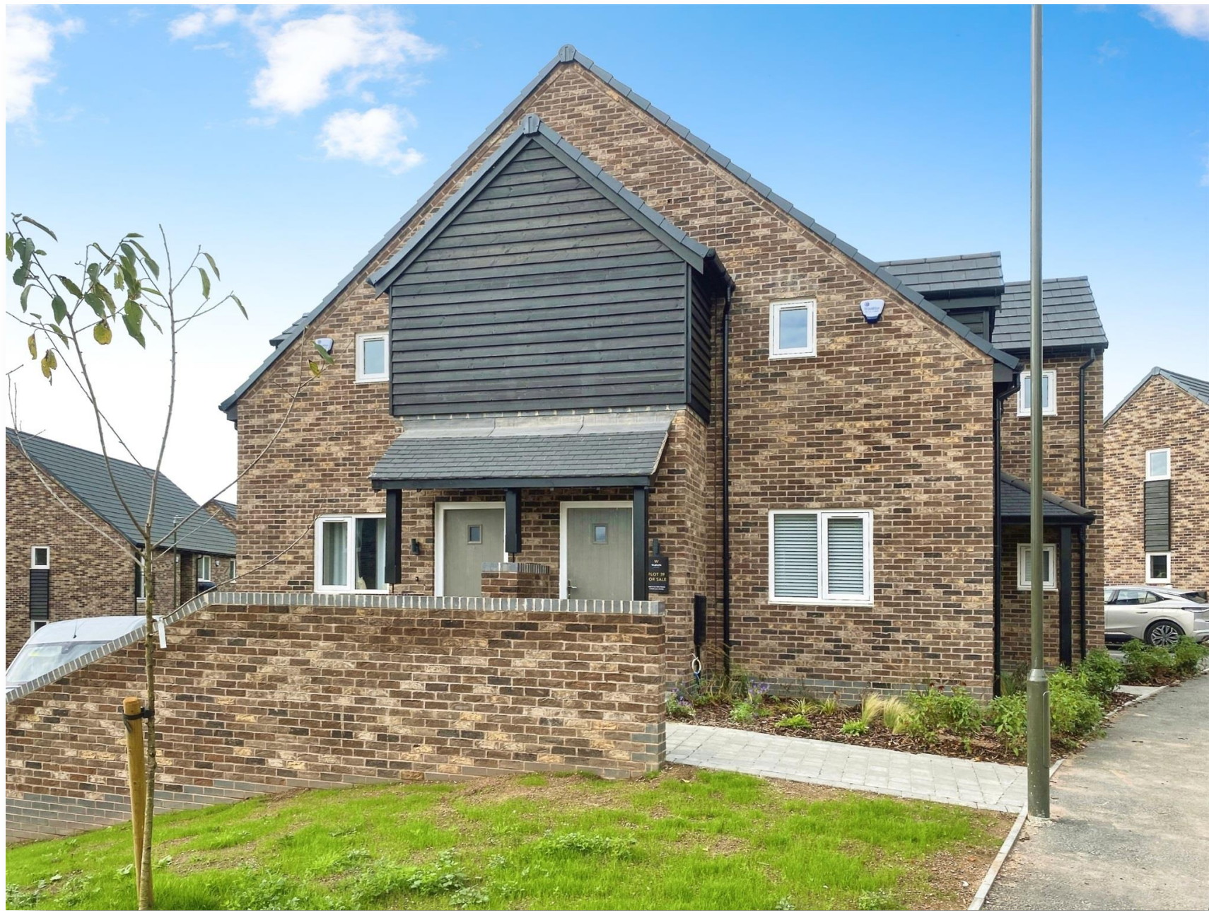
Deer Park Close,Alfreton DE55 7ST