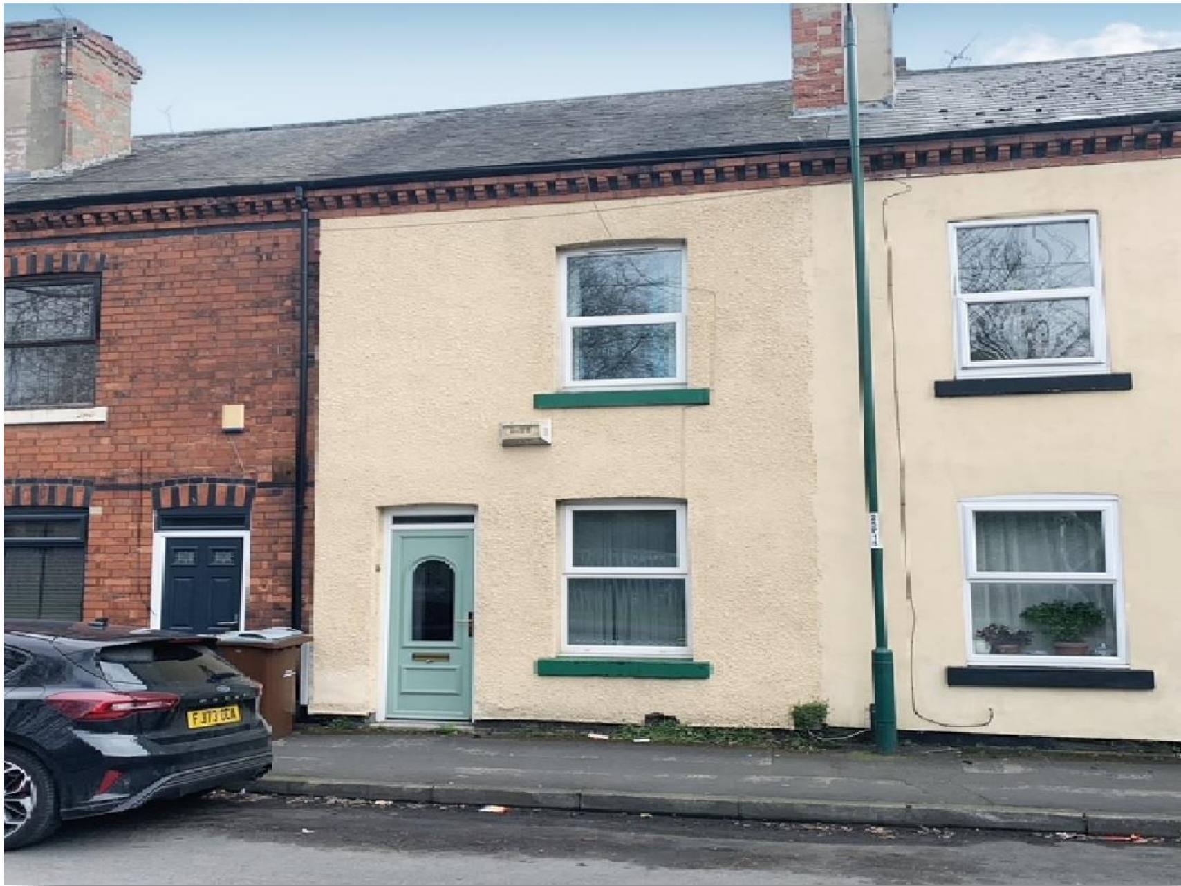
Park Lane, Nottingham NG6 0EU