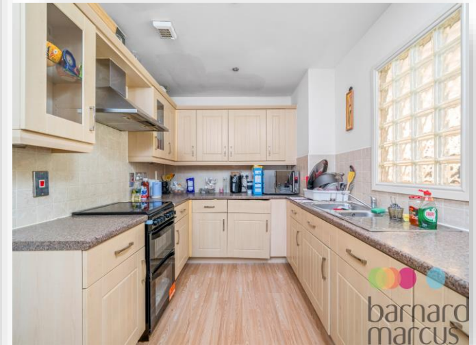
Compton Court Crowder Close, London N12 0AT