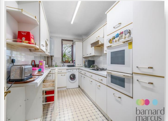
Hamilton Square, Sandringham Gardens, London, N12 0PL