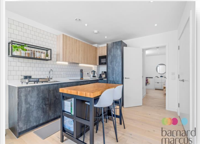
Bartram House, Maurice Browne Avenue, London, NW7 1SN