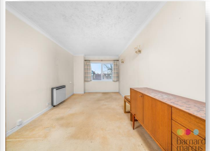
Lychgate Court, Friern Park, London, N12 9UL