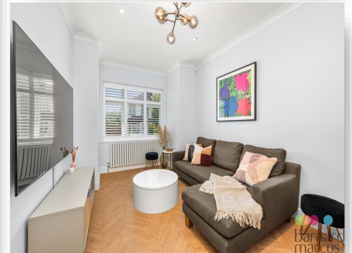
Falkland Avenue, London N11 1JS