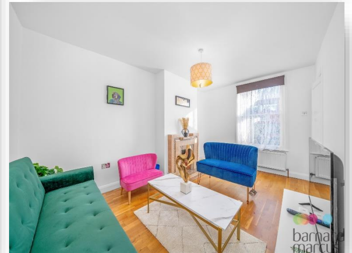
The Burroughs, London, NW4 4AX