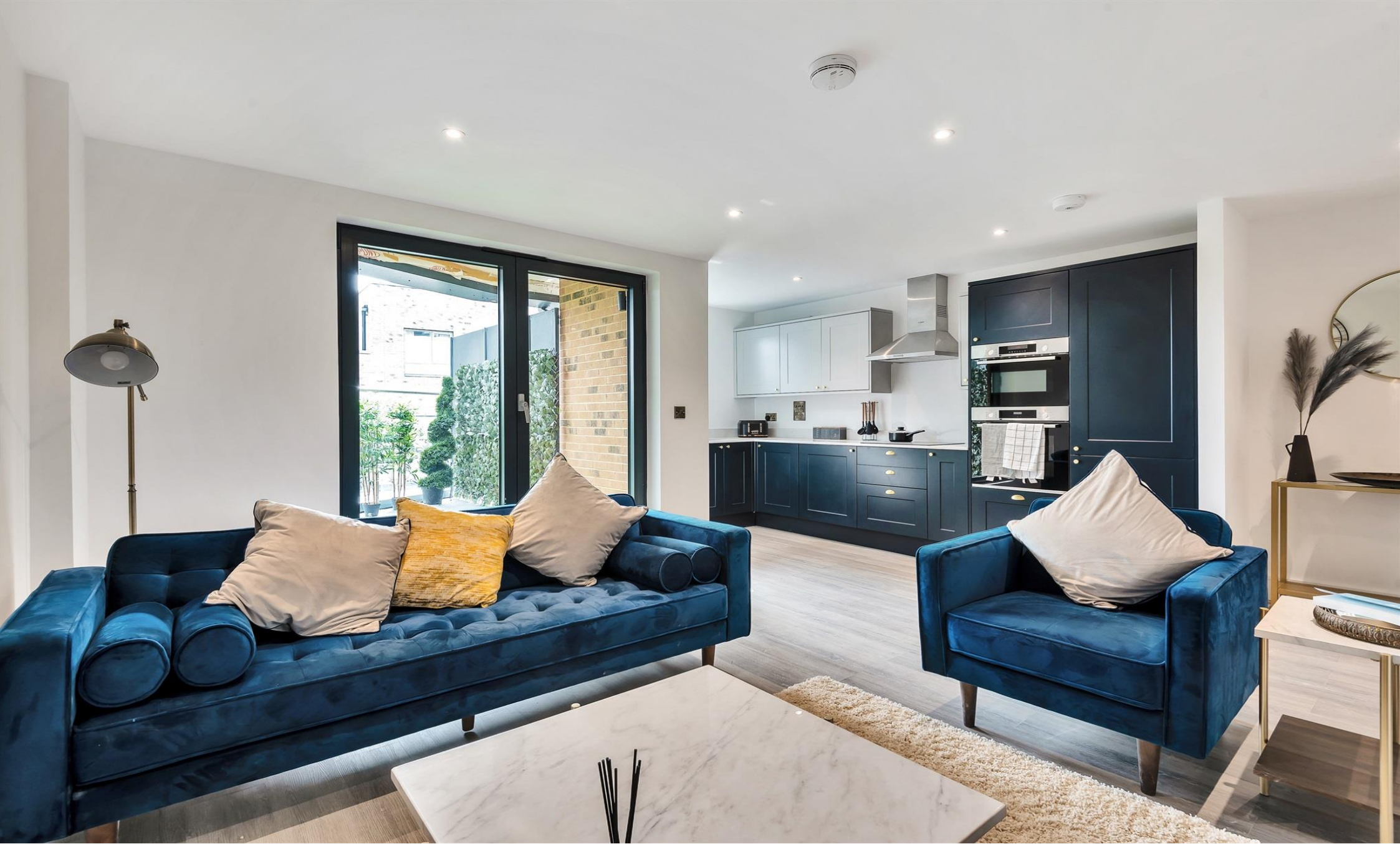
The Penthouse Collection, Palmers Green, London, N13 4NP