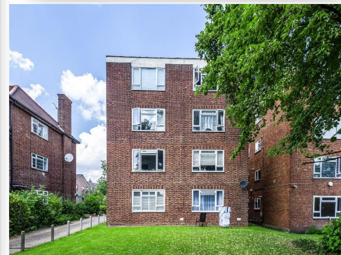
Murray House Torrington Park, North Finchley London, N12 N12 9TG