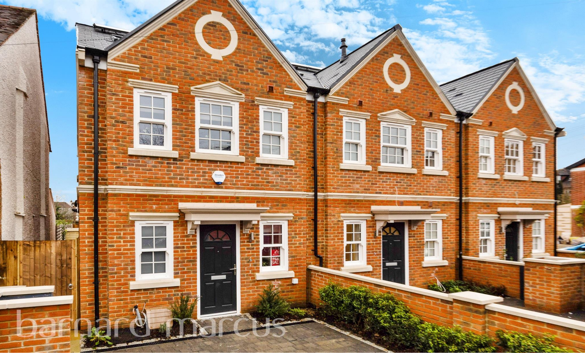
Cavendish Place, Cleveland Road, New Malden KT3 3QQ