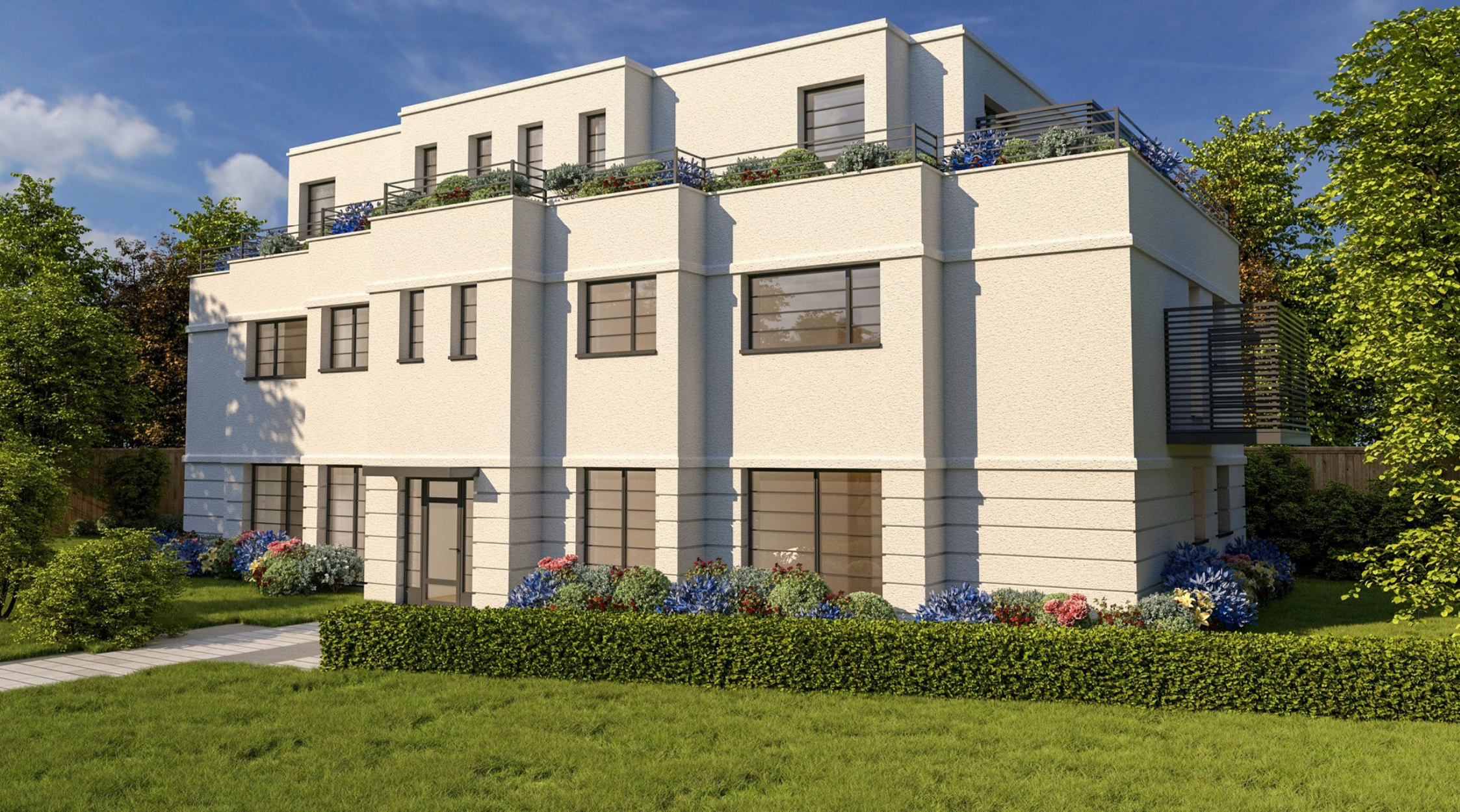
Avon Court, Barton Green, New Malden, KT3 3HU