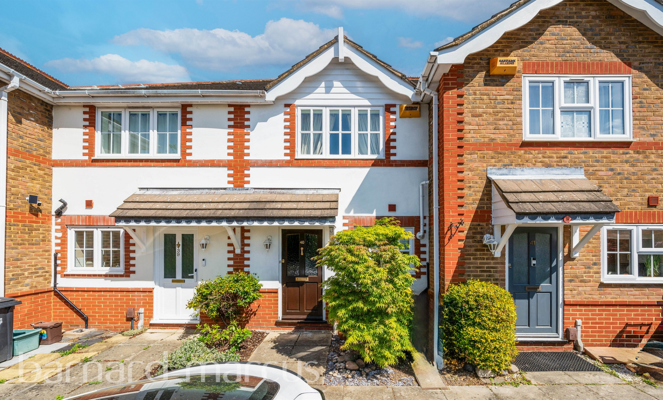
Archdale Place, New Malden, KT3 3RW