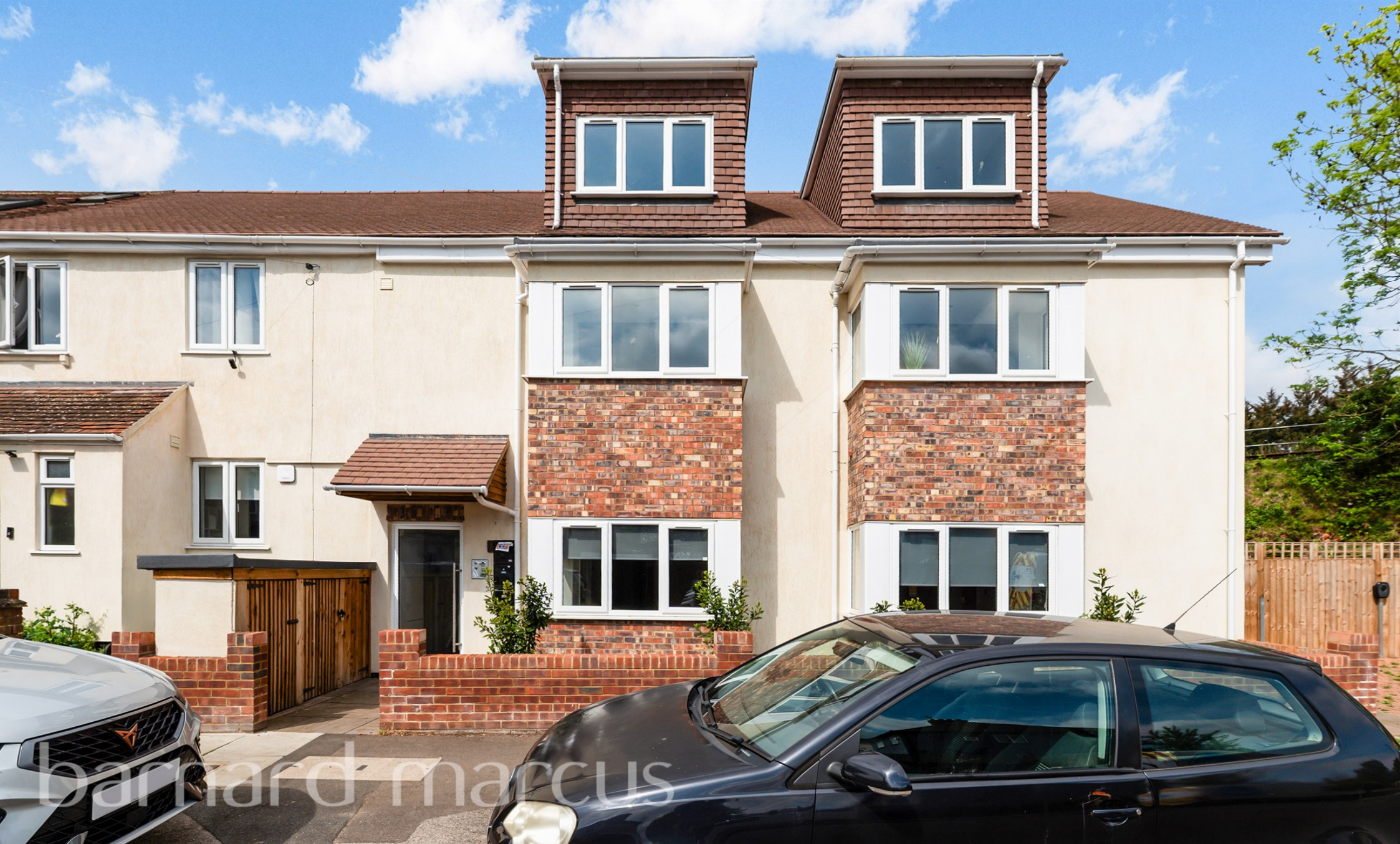
Aspatria House, South Lane West, New Malden, KT3 5AQ