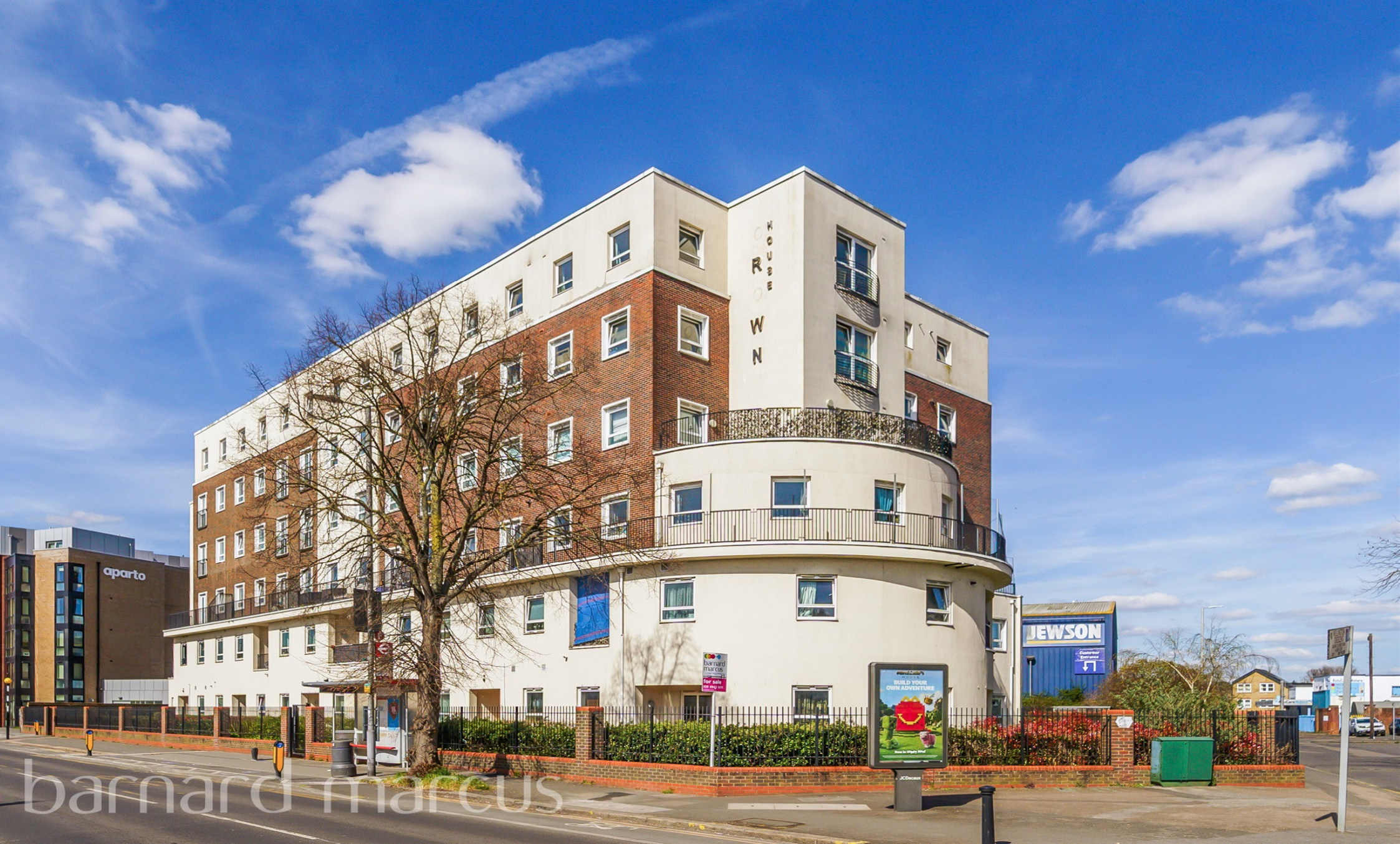
Crown House, Kingston Road, New Malden, KT3 3NA