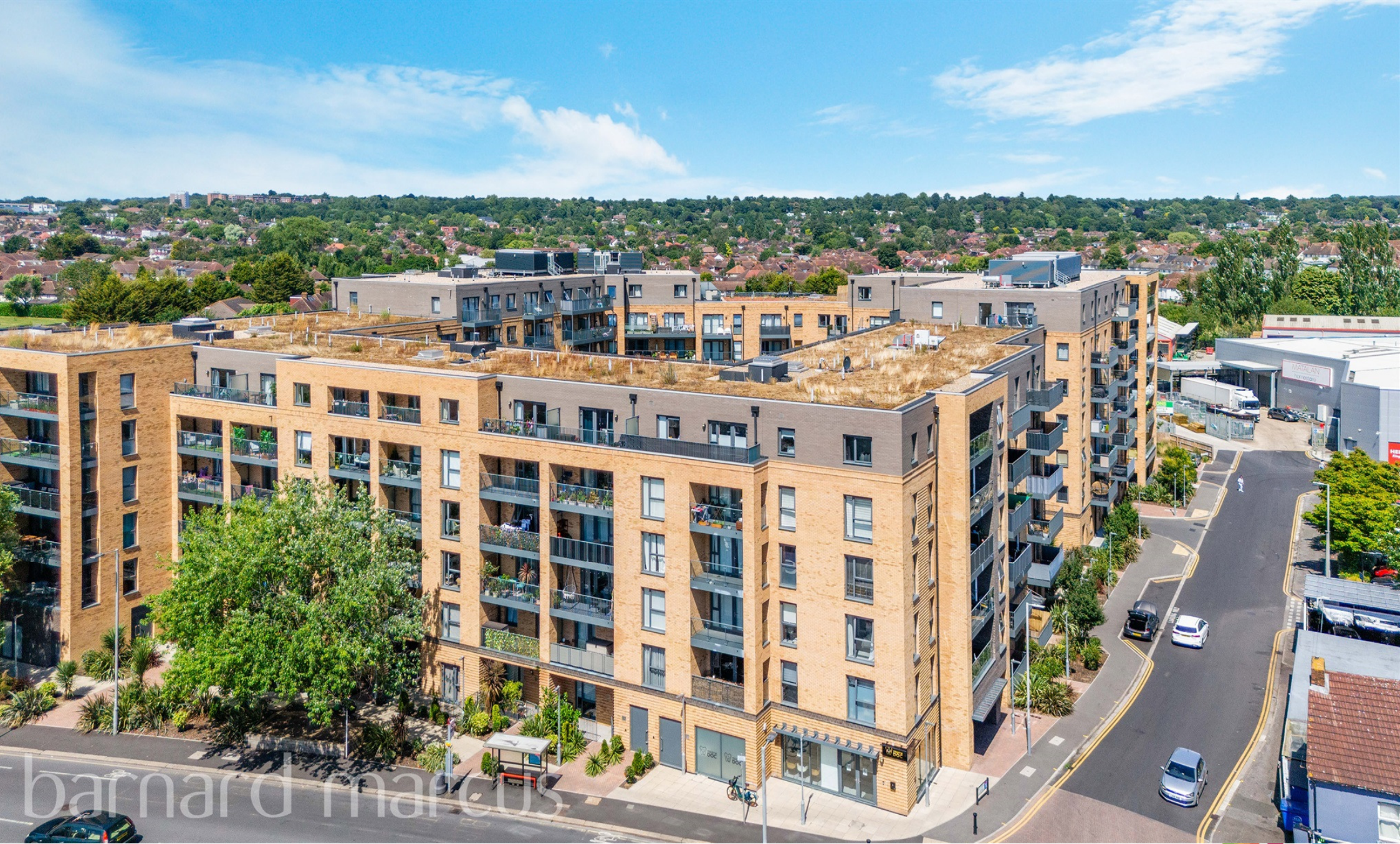
Seathwaite House, Kingston Road, New Malden, KT3 3FP