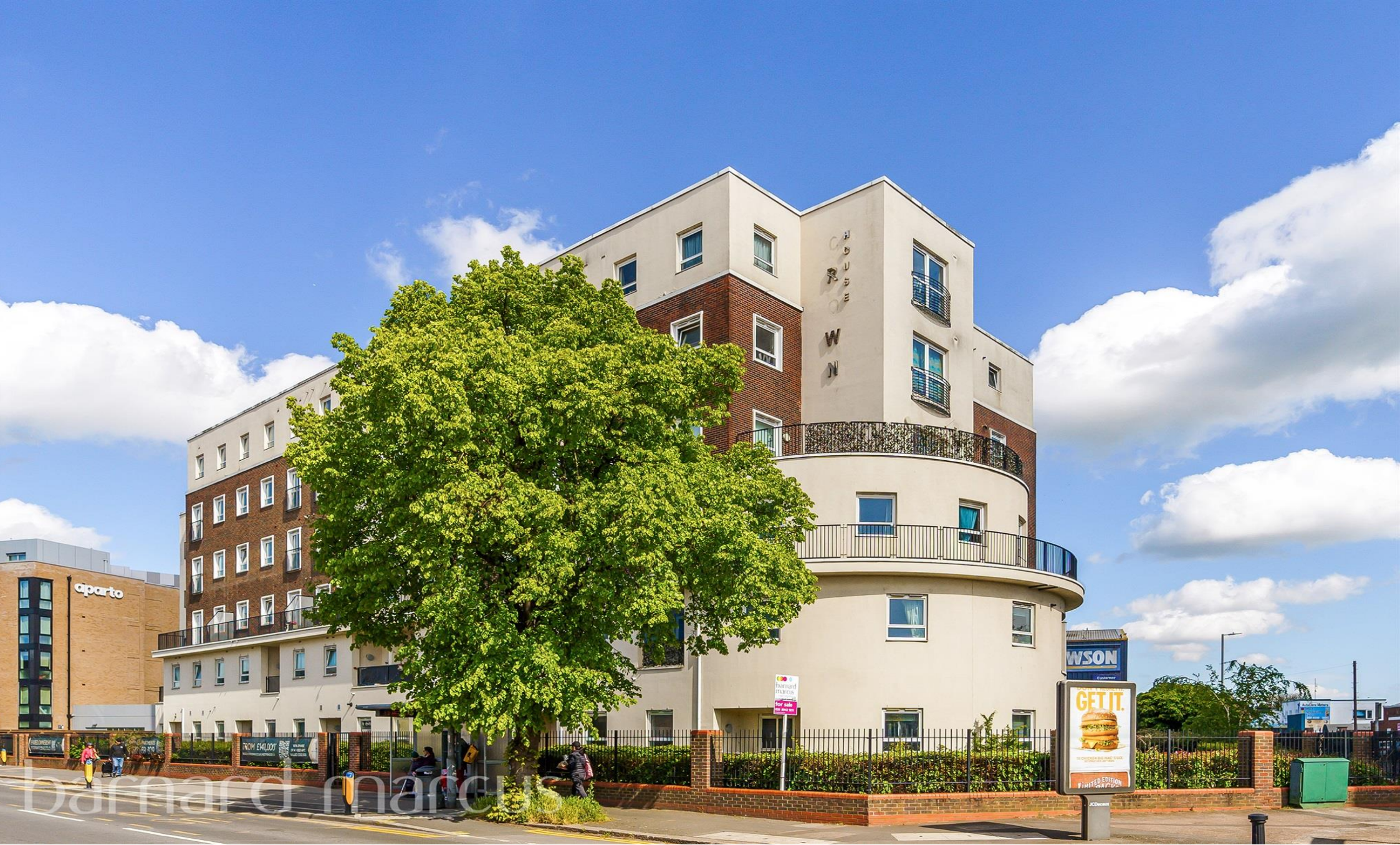
Crown House Kingston Road, New Malden KT3 3NA