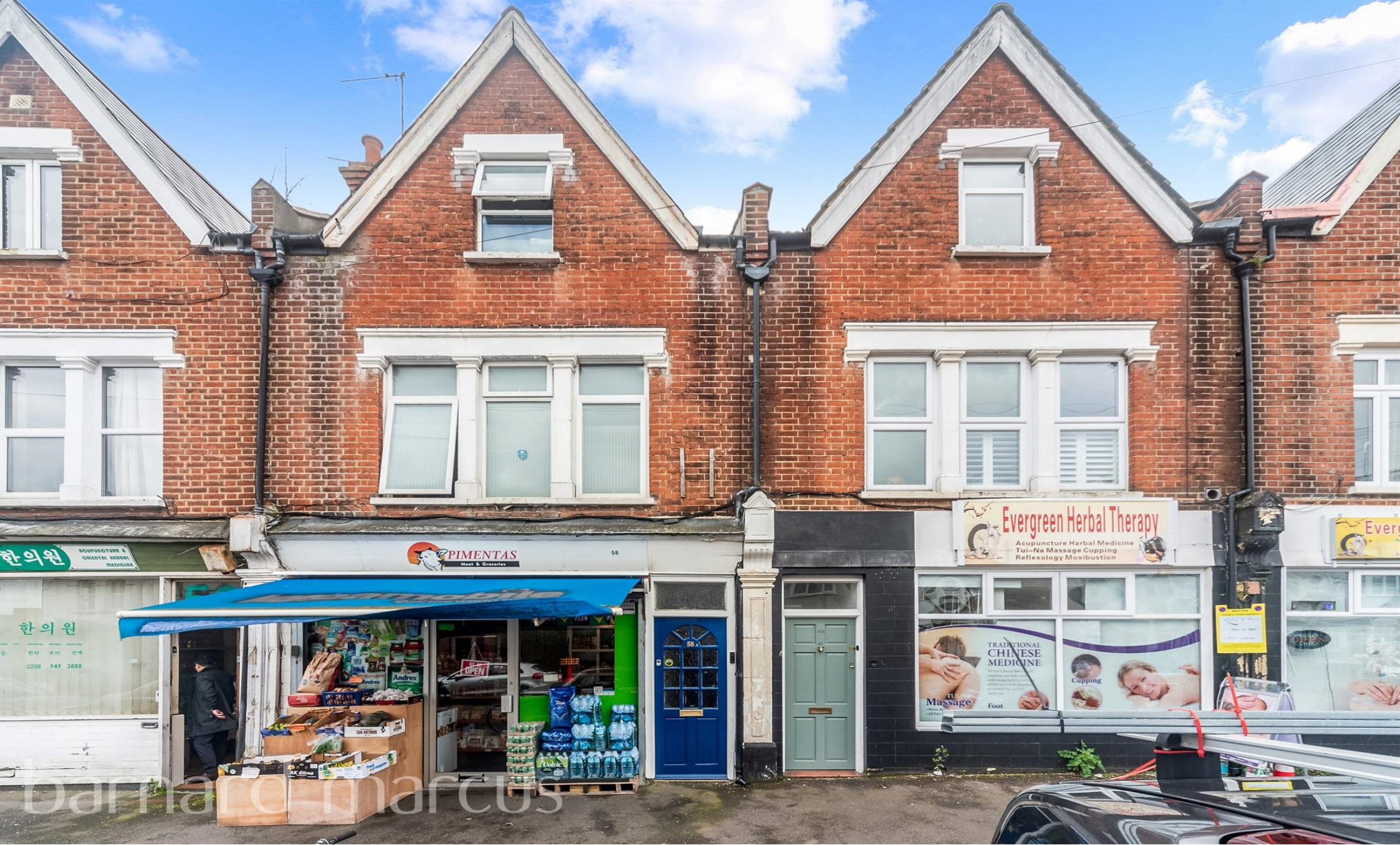
Cambridge Road, New Malden KT3 3QL