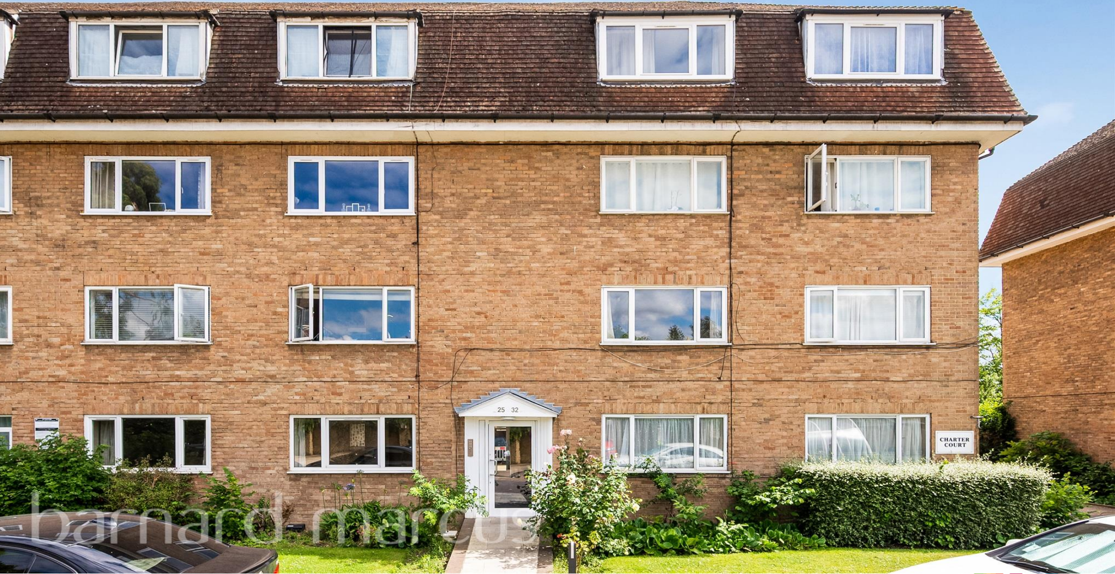
Charter Court Linden Grove, NEW MALDEN KT3 3BL