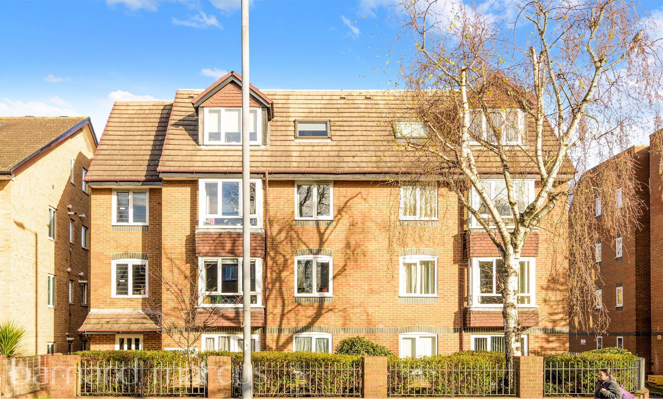
Kingston Lodge Kingston Road, New Malden KT3 3PN