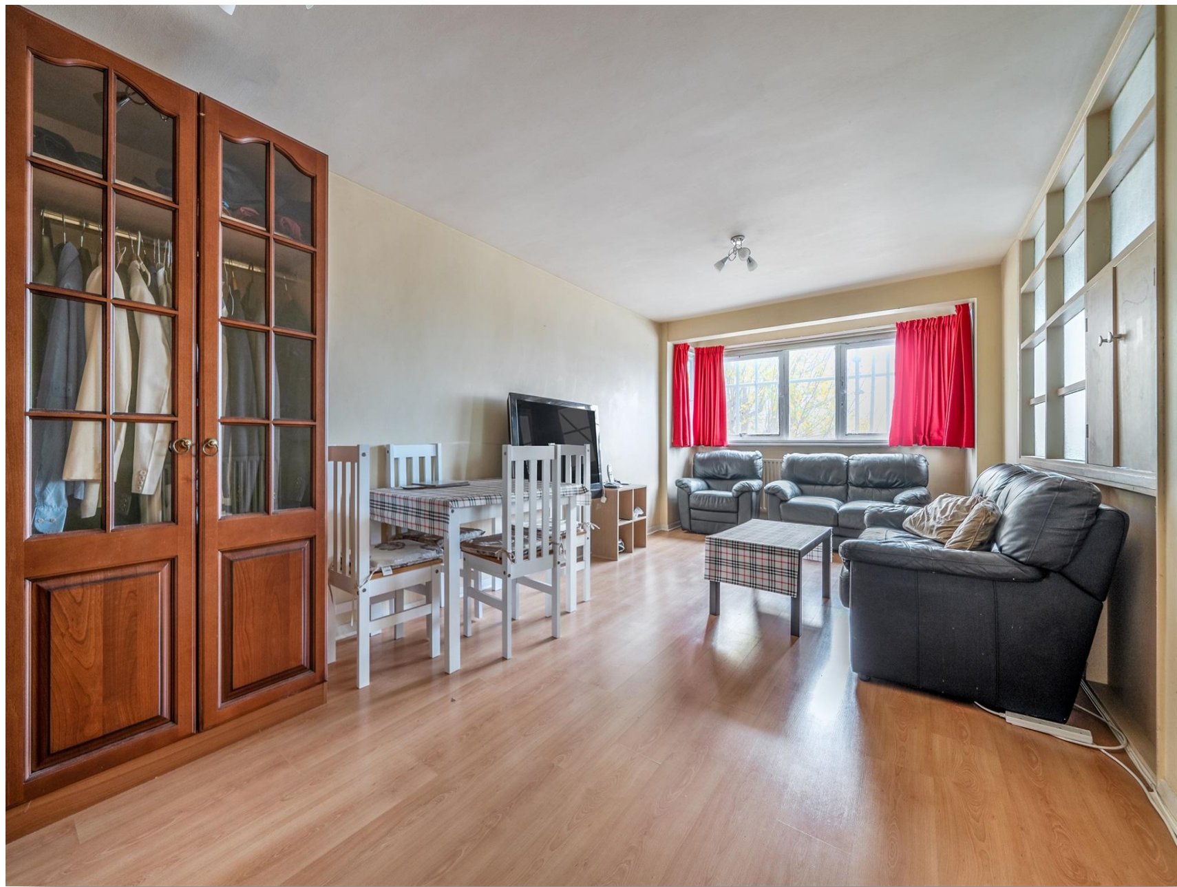
Deanswood, Maidstone Road, London N11 2TQ