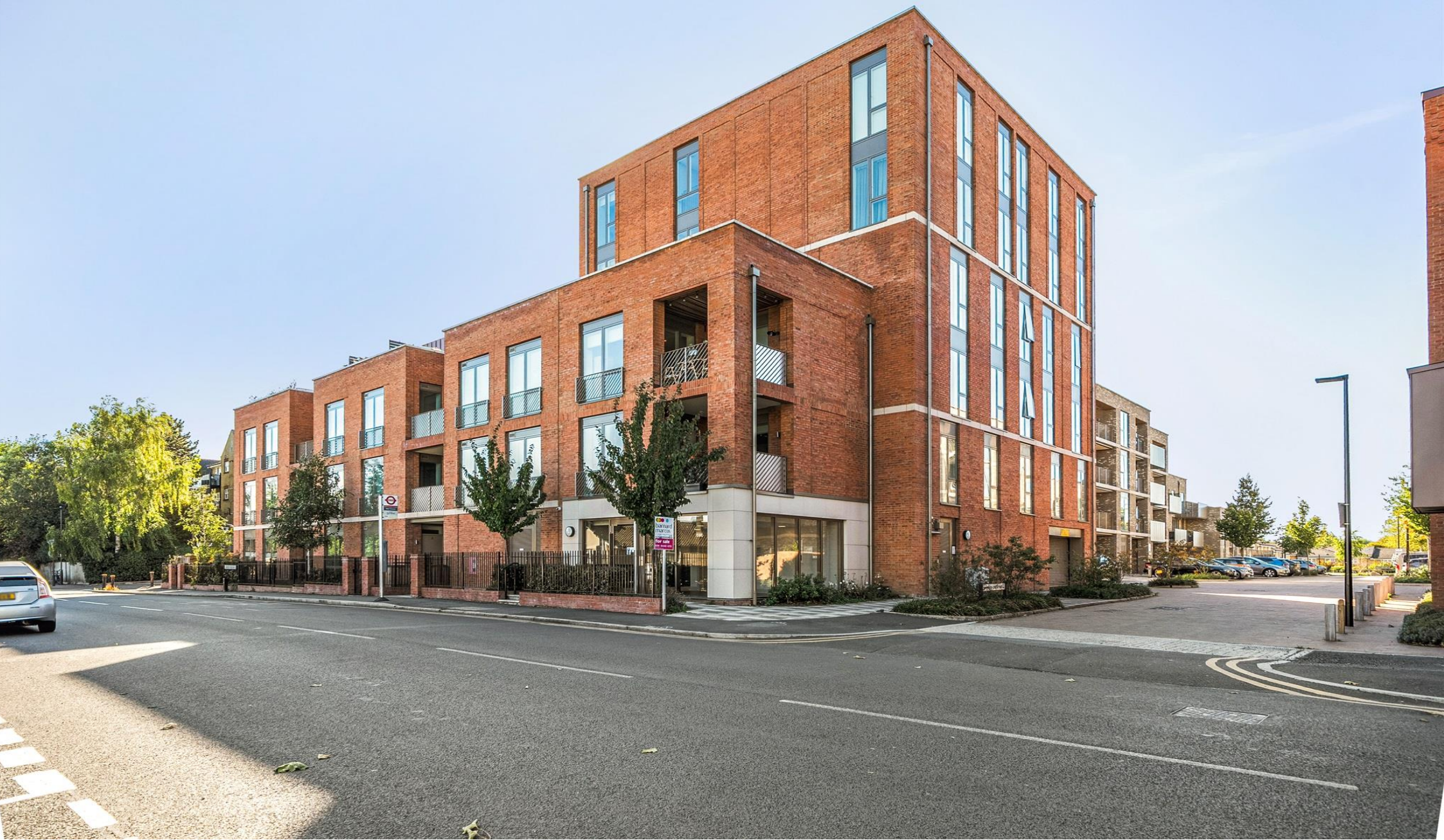
Oakwood Crescent, LONDON N10 1EZ