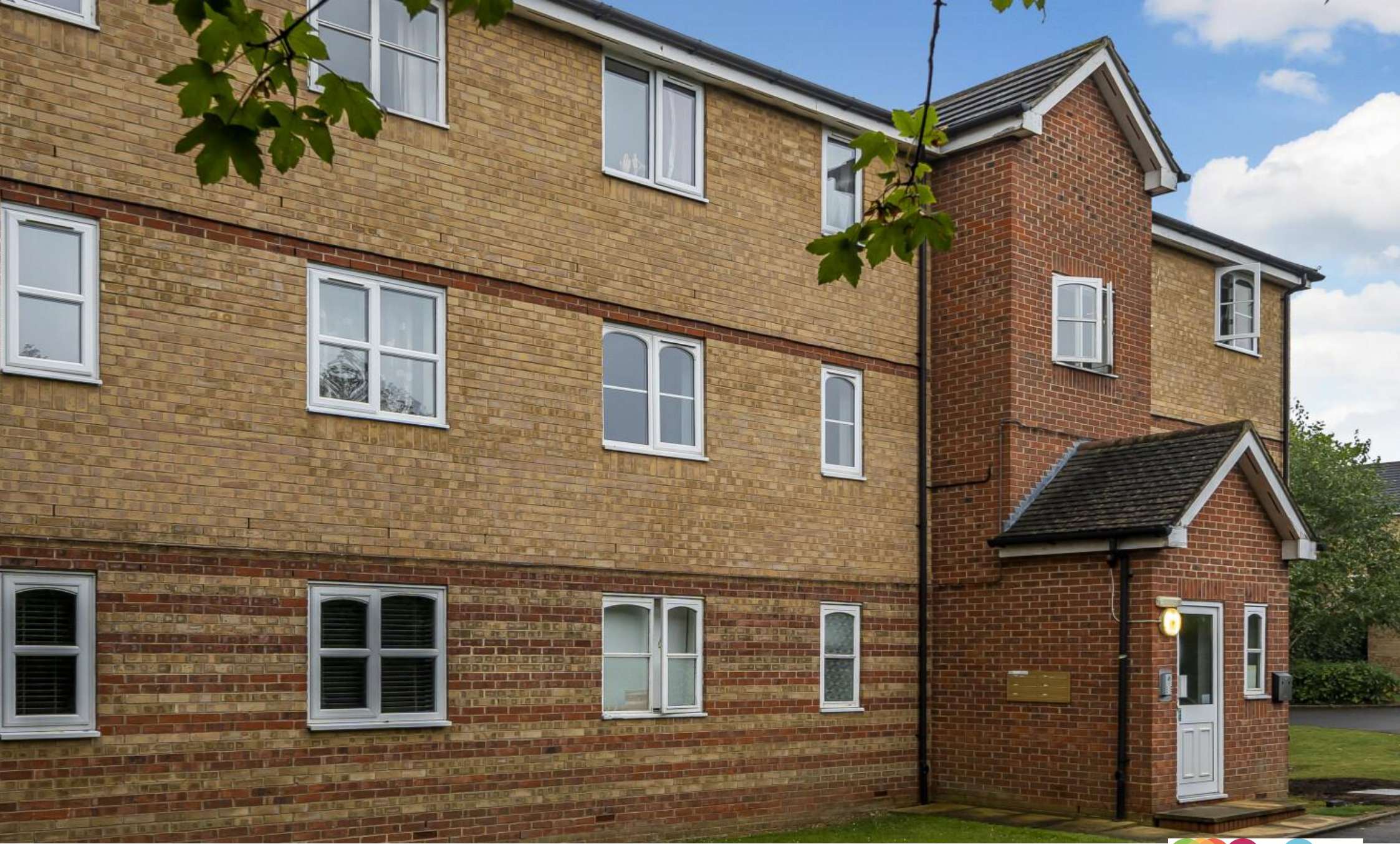
Simms Gardens, London N2 8HT